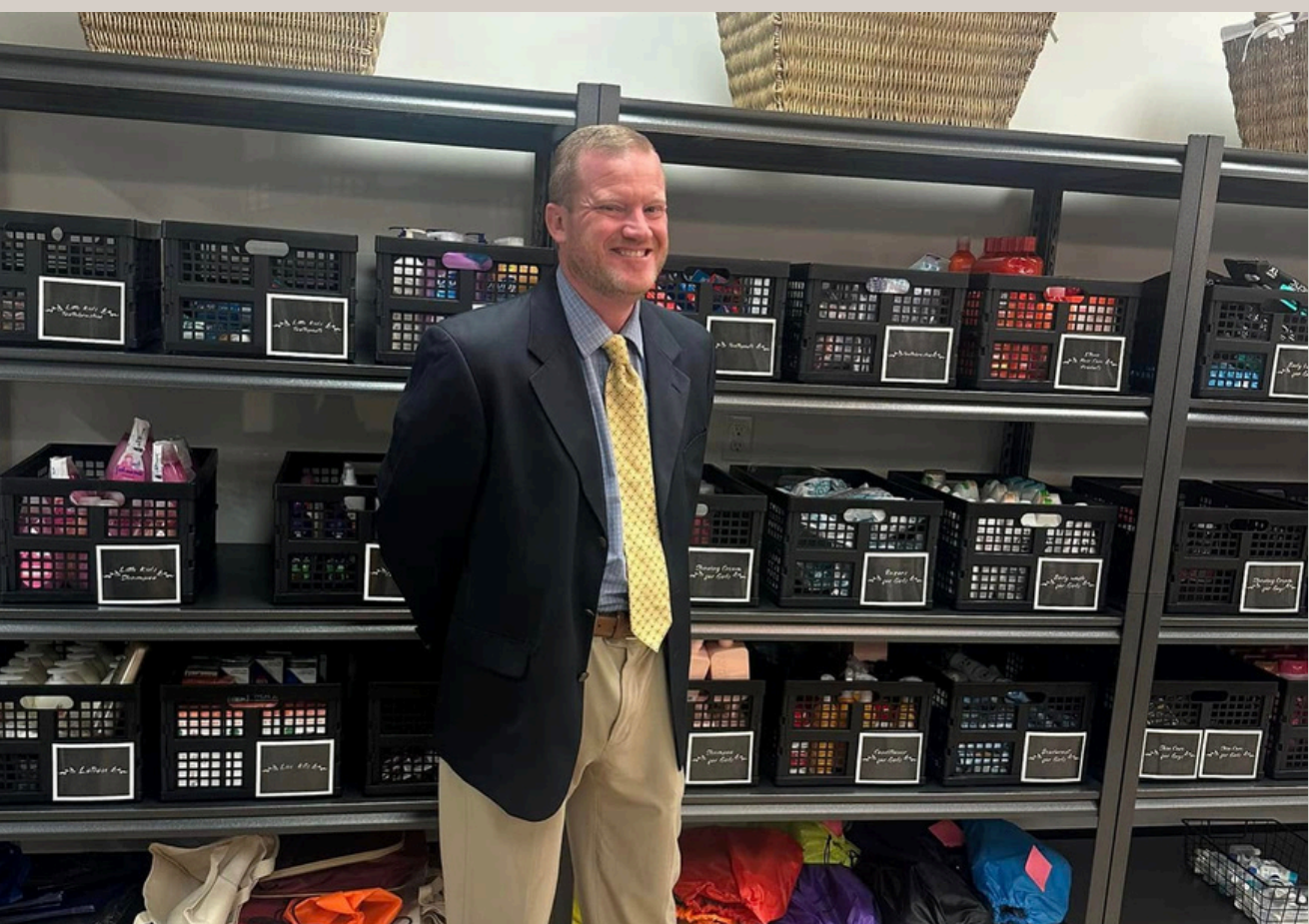
Moments from Open House