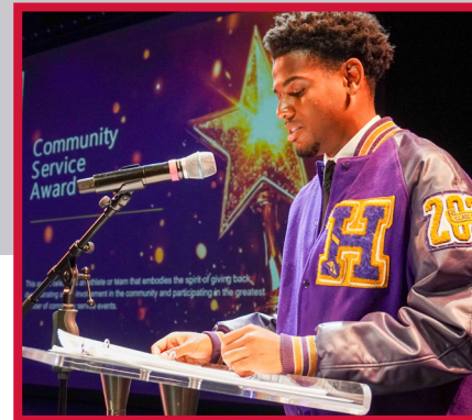
Hahnville High School student-athlete presents the Community Service Award.