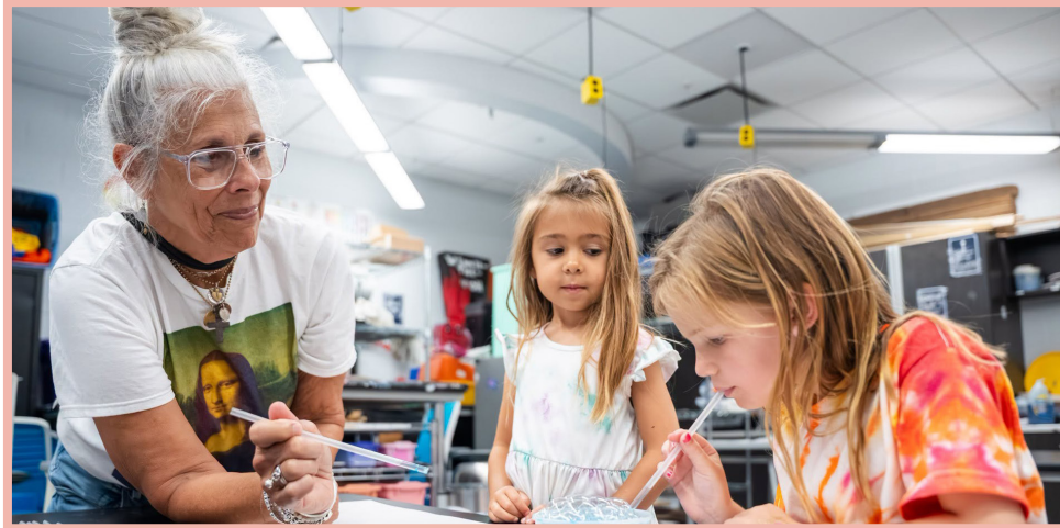
Throughout the camp, students experimented with painting, drawing, mixed media, tie-dye, glow-in-the-dark art, and other hands-on projects designed to encourage artistic exploration and self-expression.

Young artists entering first through eighth grades participated in the visual arts intensive, exploring a variety of creative mediums under the guidance of St. Charles Parish Public Schools' visual art teachers.