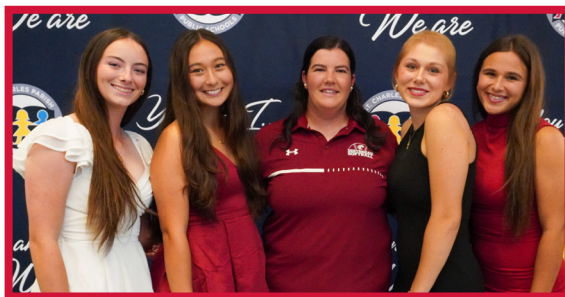
Destrehan High School student-athletes pose with assistant softball coach during the inaugural Athletic Awards Ceremony.

By bringing together student-athletes, coaches, families, and community members for a districtwide celebration, the inaugural Athletics Awards Ceremony established a new tradition that highlights the role athletics play in developing leadership, character, and school pride.