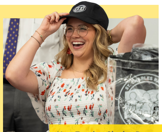
New Teacher Signing Day

Commitment C: Diverse, Effective, and Engaged Employees includes strengthened recruitment pipelines through university partnerships, dual certification pathways, and the REACH Residency Program. Retention efforts include expanded "Promise to Return" agreements, enhanced onboarding and mentoring systems, and districtwide Stay Interviews. Leadership development continues through structured academies and cohort-based programs. Employee engagement has been strengthened through recognition initiatives and expanded wellness supports, including programs addressing chronic health conditions and preventive care.