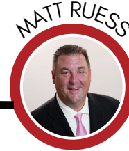
Chief Financial Officer