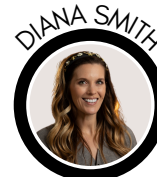
Director of Grants and Assessments