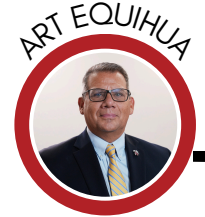
Chief Human Resource Officer