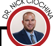
Director of Elementary Education