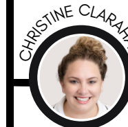
Director of Food Services