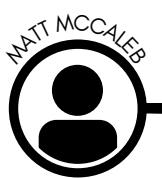
Director of Transportation