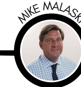
Director of Buildings & Grounds