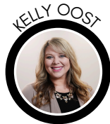
Asst Director of Exceptional Education