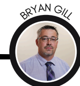
Director of Technology