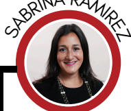
Director of Secondary Education