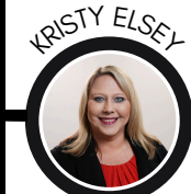
Asst Director Elementary Education