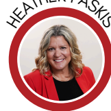
Director of Exceptional Education