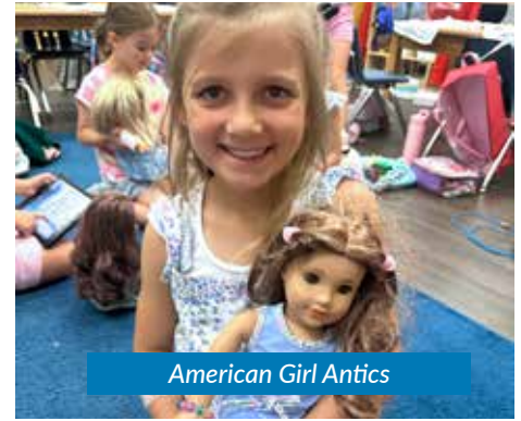
American Girl Antics