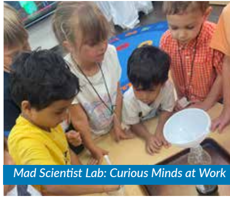
Mad Scientist Lab: Curious Minds at Work