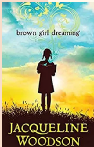
Brown Girl Dreaming by Jacqueline Woodson

Prejudice, poetry, family, self-discovery