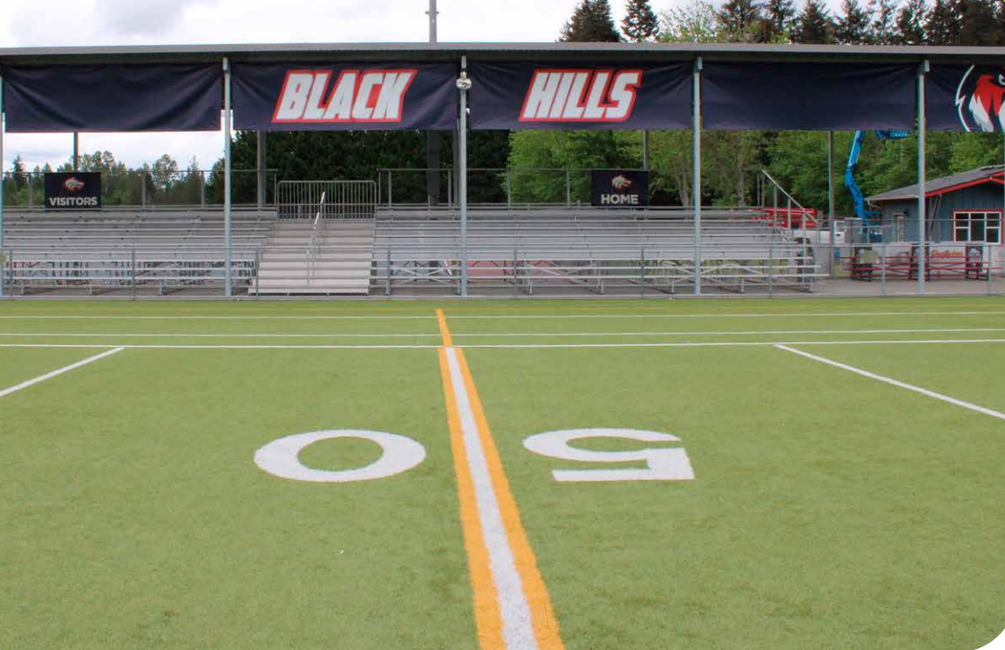
The new covered bleachers at Black Hills High School provide fans with a comfortable, weather-protected place to cheer on their teams and enjoy every moment of the game—rain or shine.