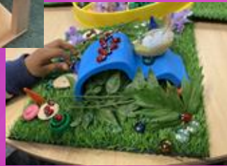
Play Based Learning