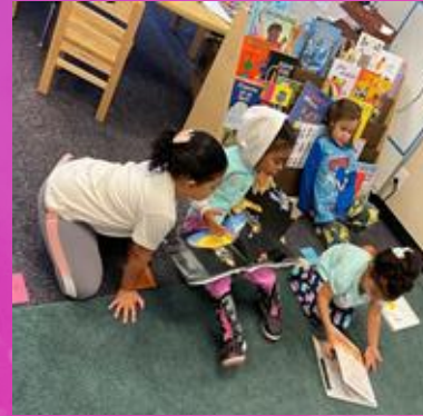
Early Academic Skills