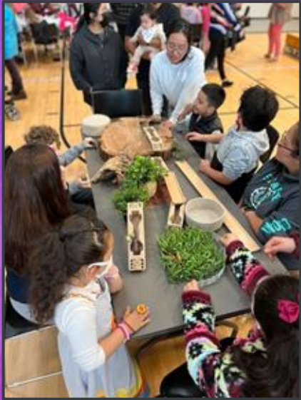
Family + Community Connection