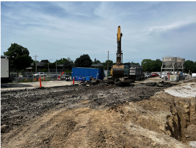
Asphalt Stripping – Southeast Of Site