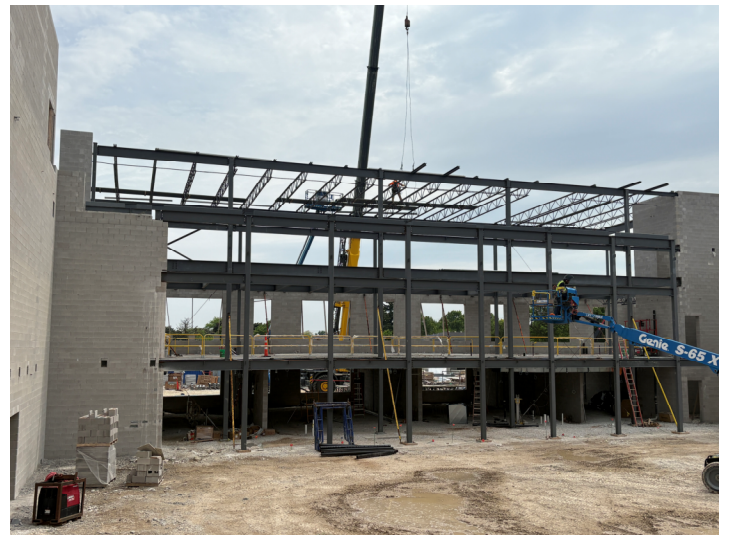
Structural Steel Joist Installed – Area C1