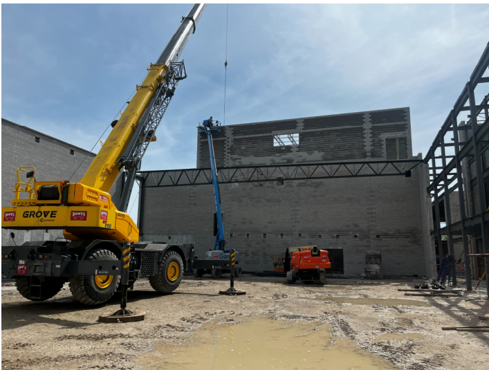
First Long Span Joist Installed – Area C2