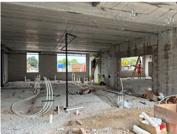
Plumbing Installed – Area C1