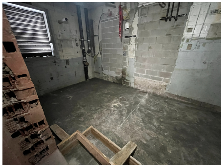
Concrete Slab Pour – Area A1