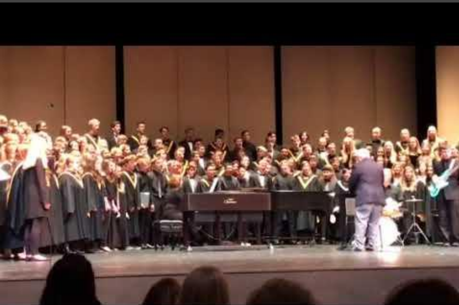
BHS Combined Choirs