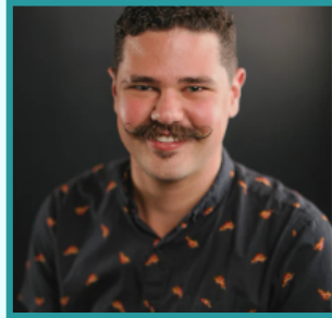
DYLAN HALE Art