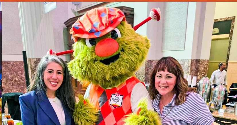
IN FIRST YEAR, HCDE RAISES $67,094 FOR EDUCATION FOUNDATION OF HARRIS COUNTY THROUGH BIRDIES FOR CHARITY P.8