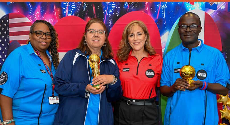
IPASS COMBINES WORLD CUP THEMING, SUCCESSFUL PARTNERSHIPS THROUGH COLLABORATION AT 5TH ANNUAL EVENT P.4