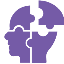
Local Organizations Supporting Mental and Behavioral Health