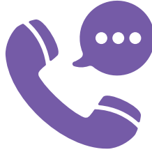
Local and National Phone Support Hotlines