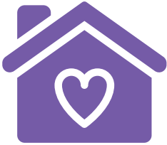
Community-Based Organizations and Resources

Navigating the community and mental health landscape can be complex. Erie Family Health Centers wants to help our communities get the care they need to feel better and stay healthy. We have developed this guide of essential resources to empower you to provide meaningful support to people who may be struggling. Here, you will find contact information for: