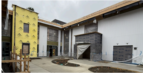
Photo: (Left) Interior Flex Space, (Right) Courtyard Concrete and Planters Please reach out to Ina Holzer with questions and/or requests for information (contact information below).