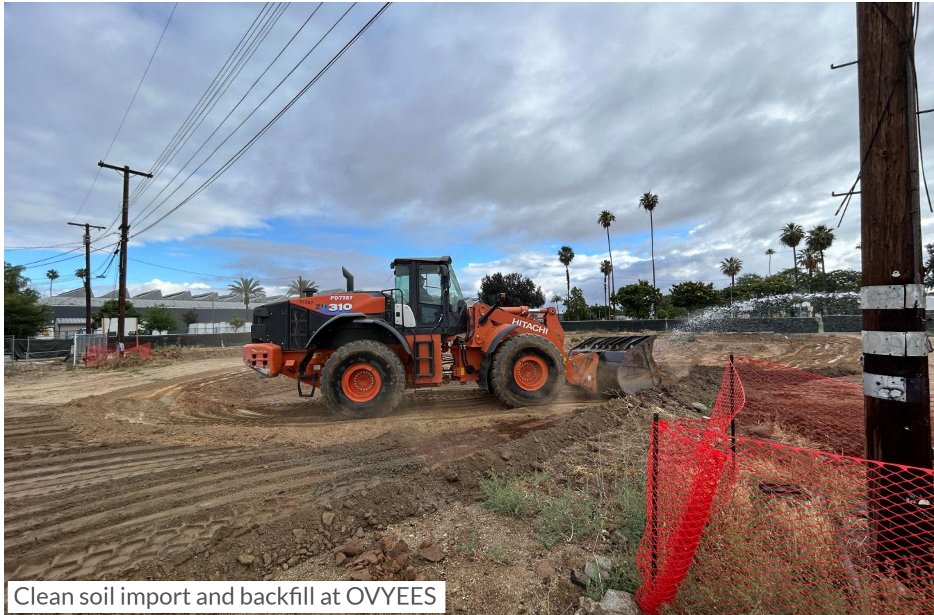
Clean soil import and backfill at OVYEES