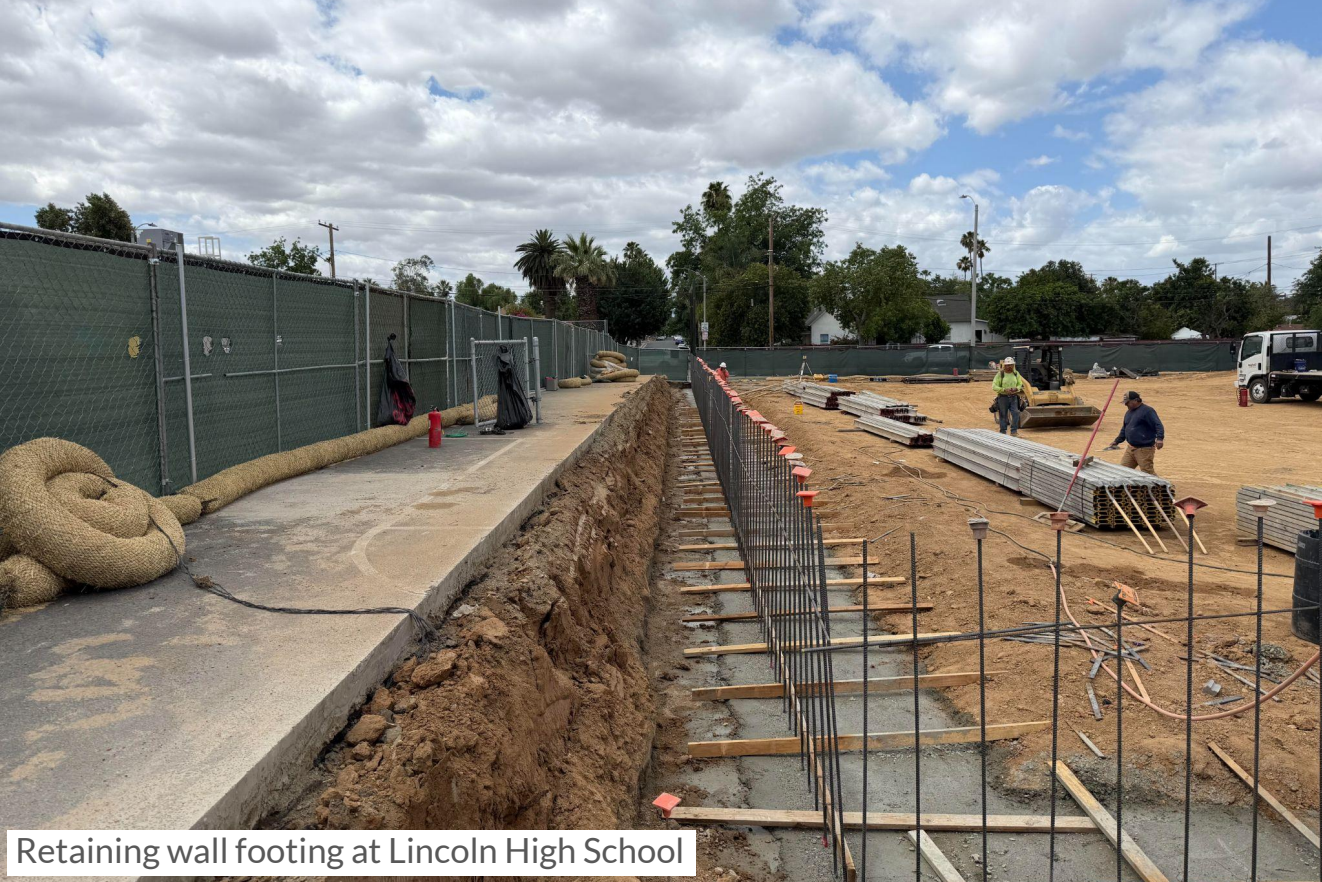
Retaining wall footing at Lincoln High School