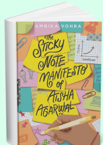
THE STICKY NOTE MANIFESTO OF AISHA AGARWAL BY AMBIKA VOHRA