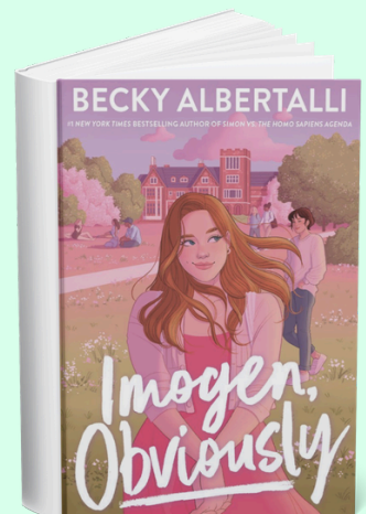
IMOGEN, OBVIOUSLY BY BECKY ALBERTALLI