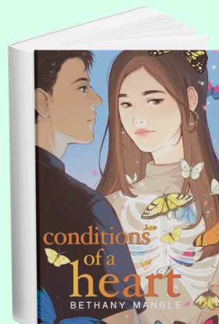
CONDITIONS OF A HEART BY BETHANY MANGLE