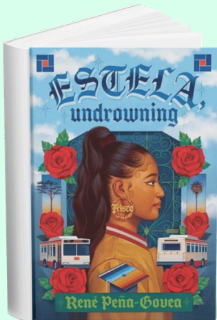
ESTELA, UNDROWNING BY RENÉ PEÑA-GOVEA