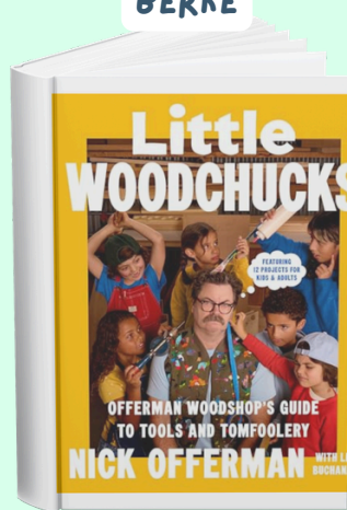
LITTLE WOODCHUCKS: OFFERMAN WOODSHOP'S GUIDE TO TOOLS AND TOMFOOLERY BY NICK OFFERMAN