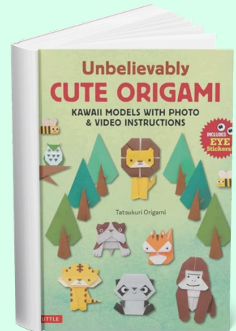
UNBELIEVABLY CUTE ORIGAMI BY TATSUKURI ORIGAMI