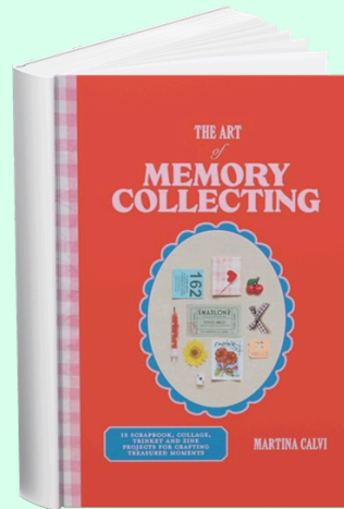
THE ART OF MEMORY COLLECTING BY MARTINA CALVI