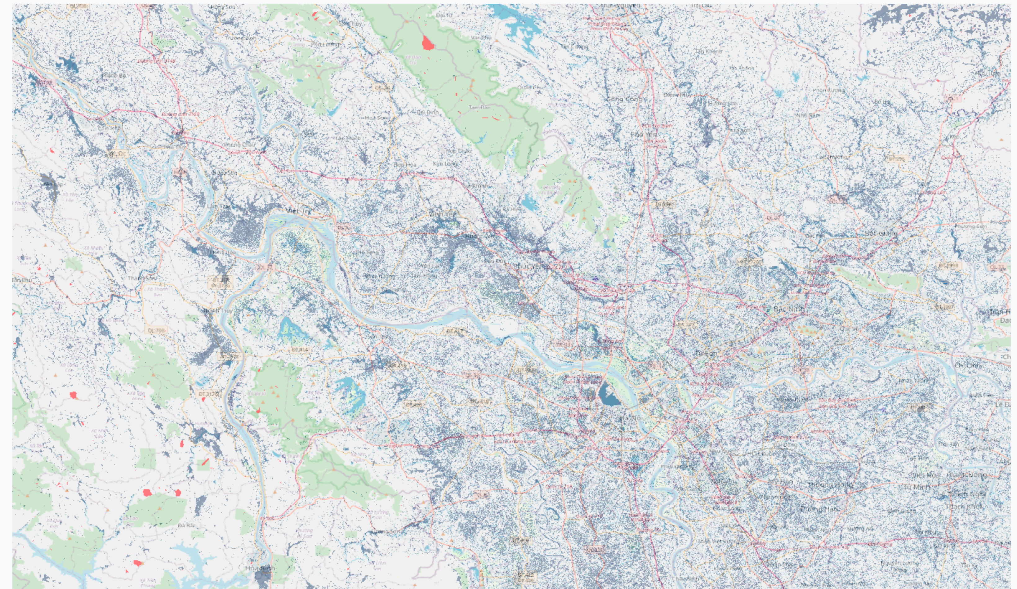
Figure 2. Mapping of Puddle Locations

Our spatial analysis confirms that Hanoi's terrain is fundamentally predisposed to puddle formation. The city's elevation—dipping low to -5m—creates a vast, low-lying landscape where water naturally accumulates. The results also identifies 2,065 micro-watershed basins with sink depths varying up to 2m, particularly concentrated in the mid-to-low altitude urban zones. These closed depressions act as natural reservoirs; because they lack hydrological connectivity and are unsupported by adequate drainage infrastructure, they facilitate the persistent formation of puddles.