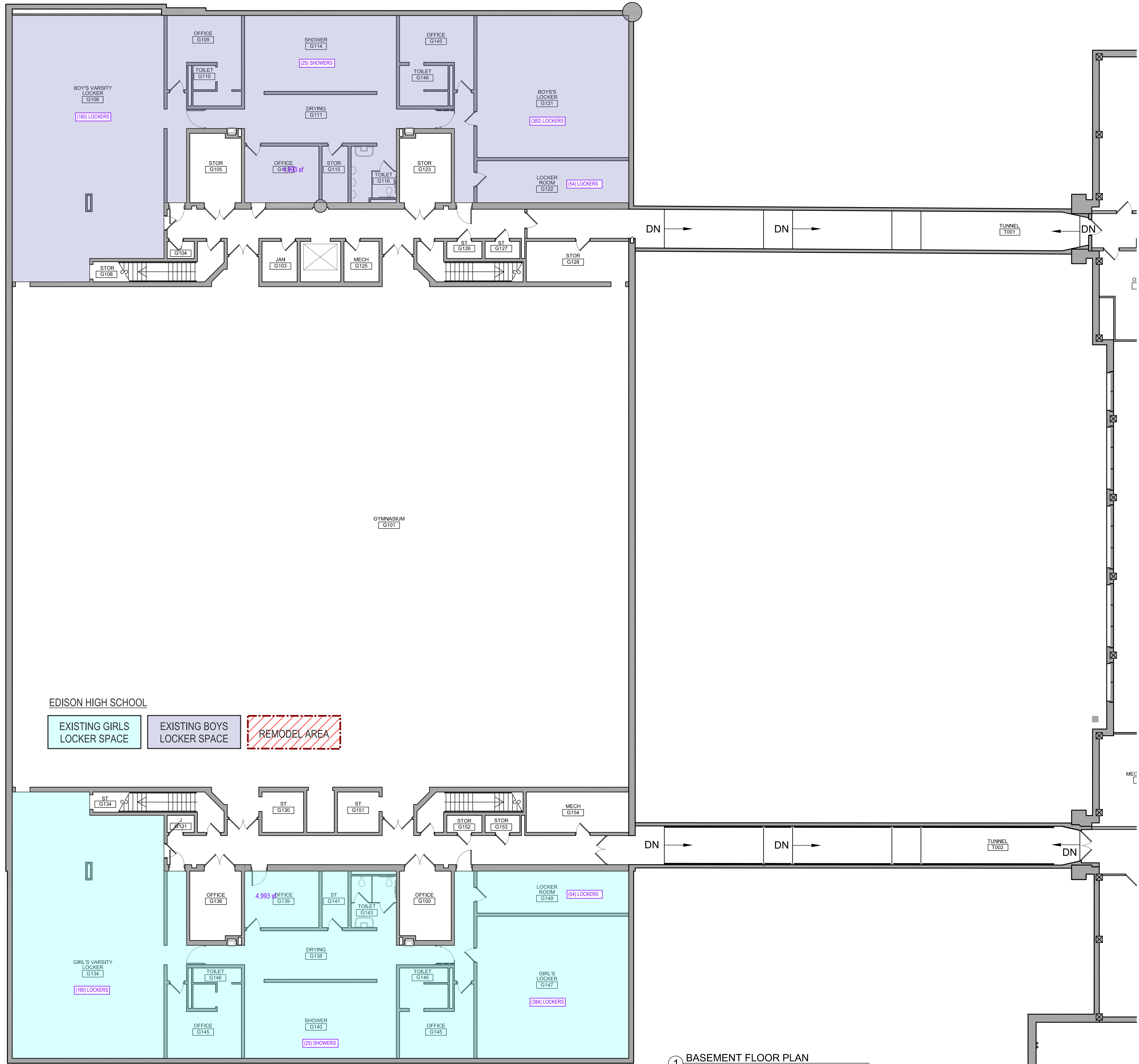
1 BASEMENT FLOOR PLAN SCALE: 1/8" = 1'-0"

02-17-2019 02:41:00 PM 100315 AR-1100 1/8" = 1'-0" 100315