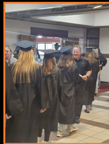
Senior Send-Off 2026

The students and staff enjoyed celebrating with our past Grant students who came back for one last visit prior to their graduation.