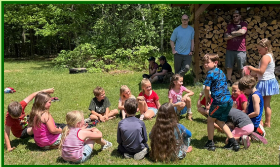
1st Grade enjoyed a beautiful day at the school forest. Some lucky students got to "push" their teachers in the pond as well!