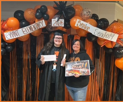
Proud staff Senior moms!