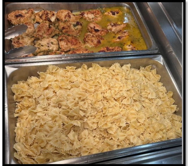
Chicken Piccata & Bowtie Pasta

Staples, Bedford and Coleytown Middle celebrated World Languages Week in April. Chartwells prepared menu items for each school to celebrate the languages and cultures being studied.