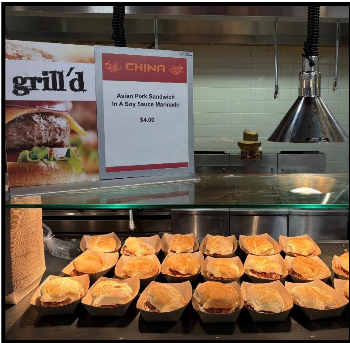
Asian Pork Sandwich