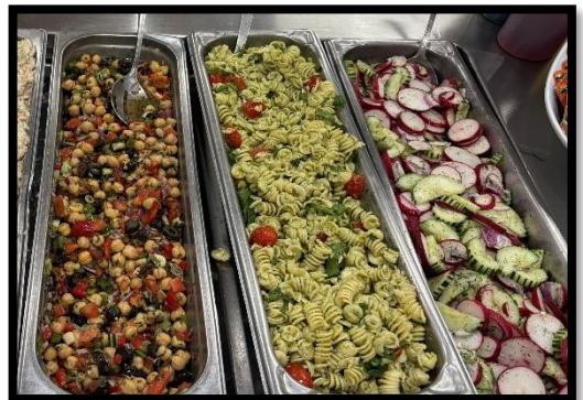
Homemade Side Salads