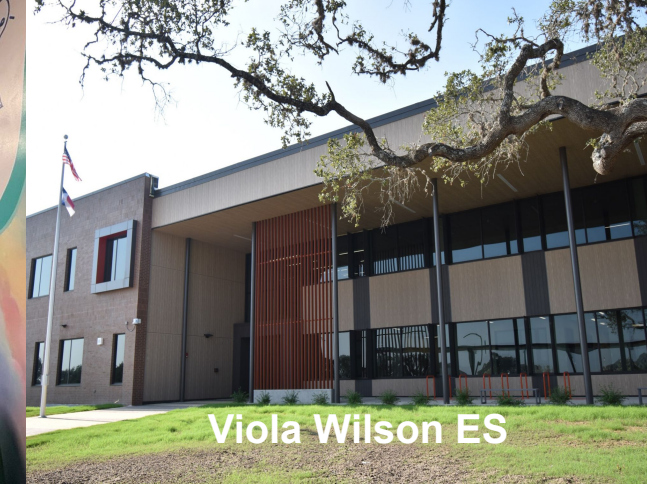
Viola Wilson ES