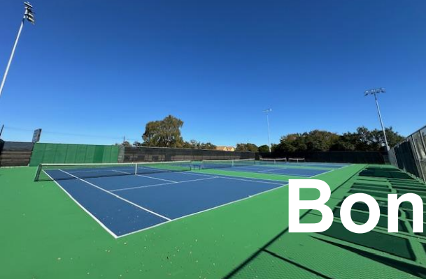
Tennis Court Lighting