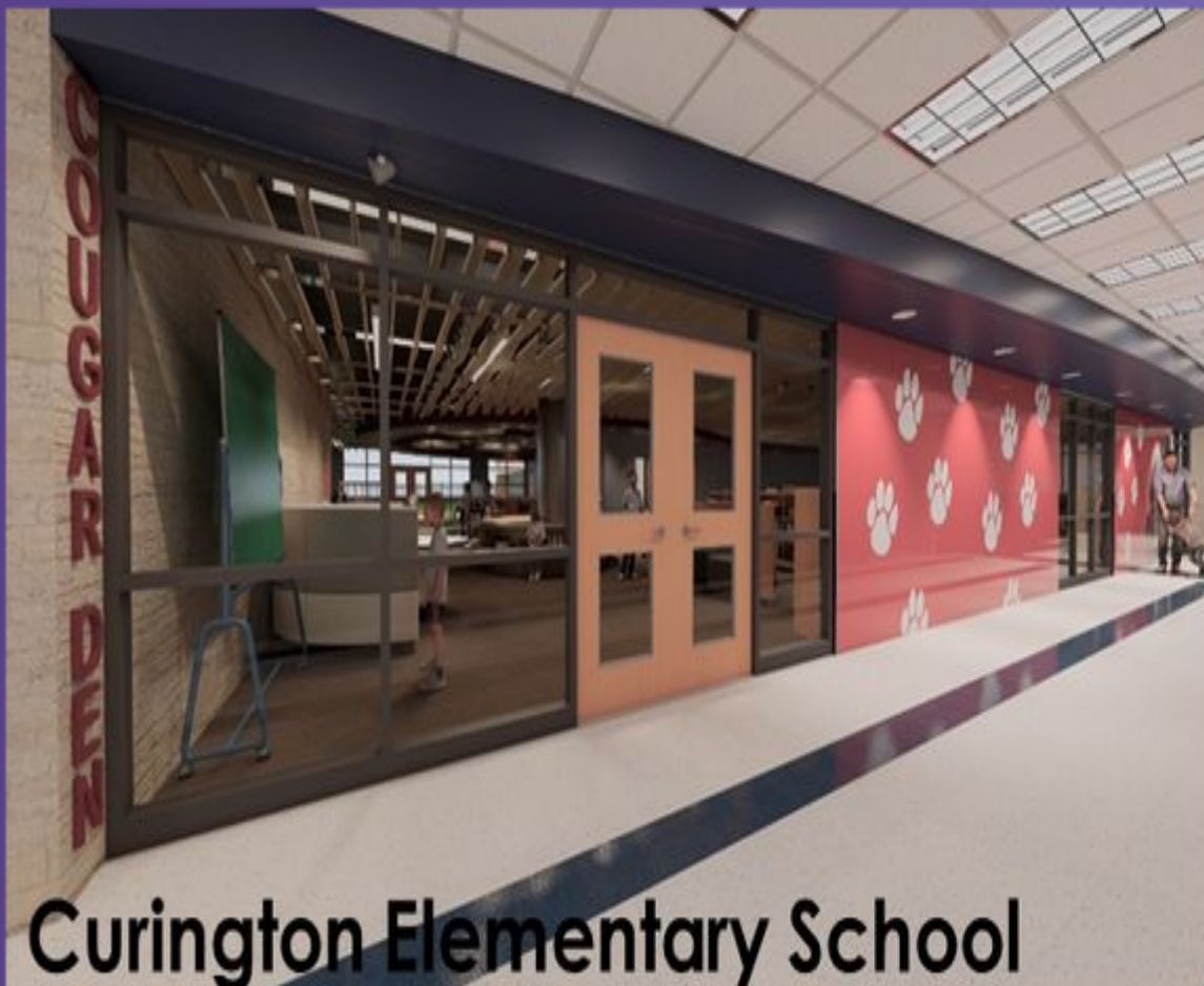
Curington Elementary School