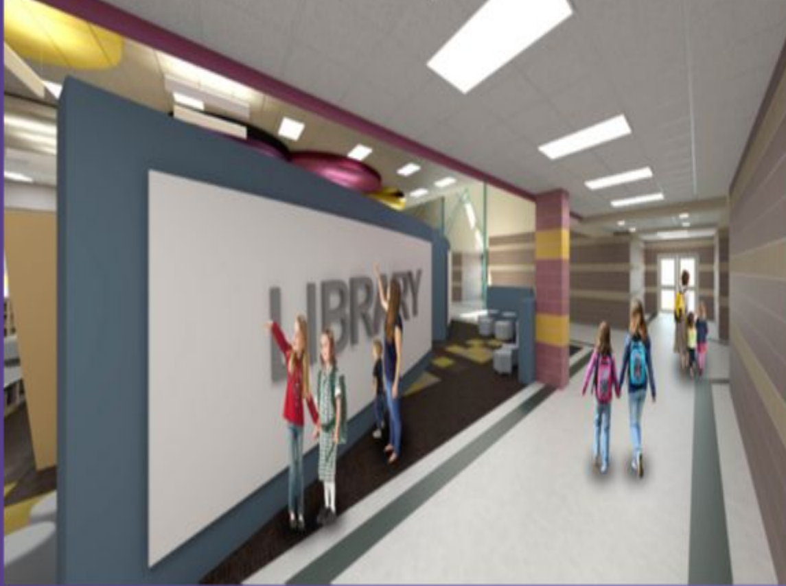
Kendall Elementary School