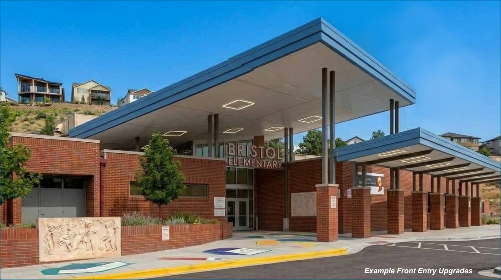
Example Front Entry Upgrades