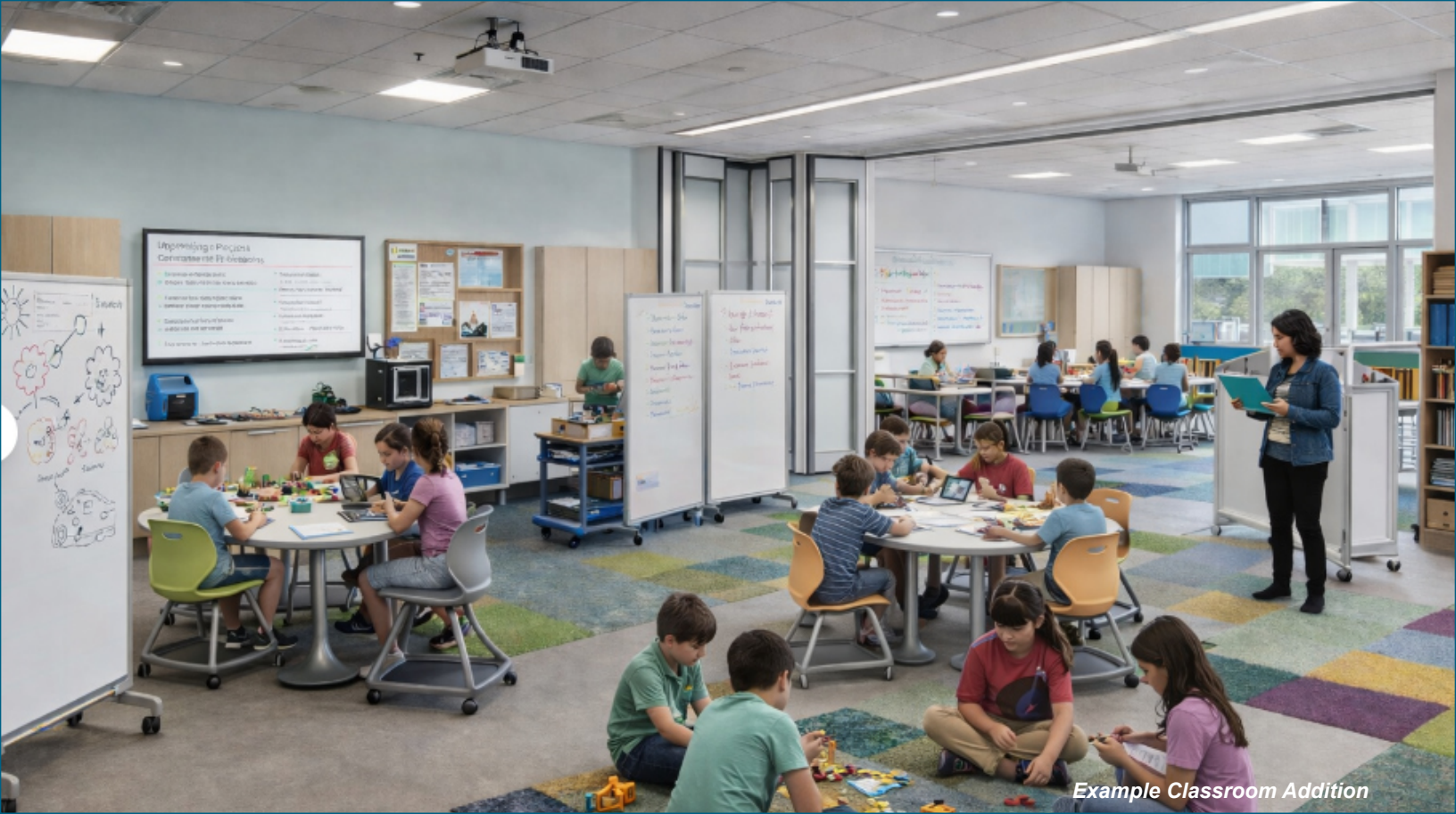
Example Classroom Addition