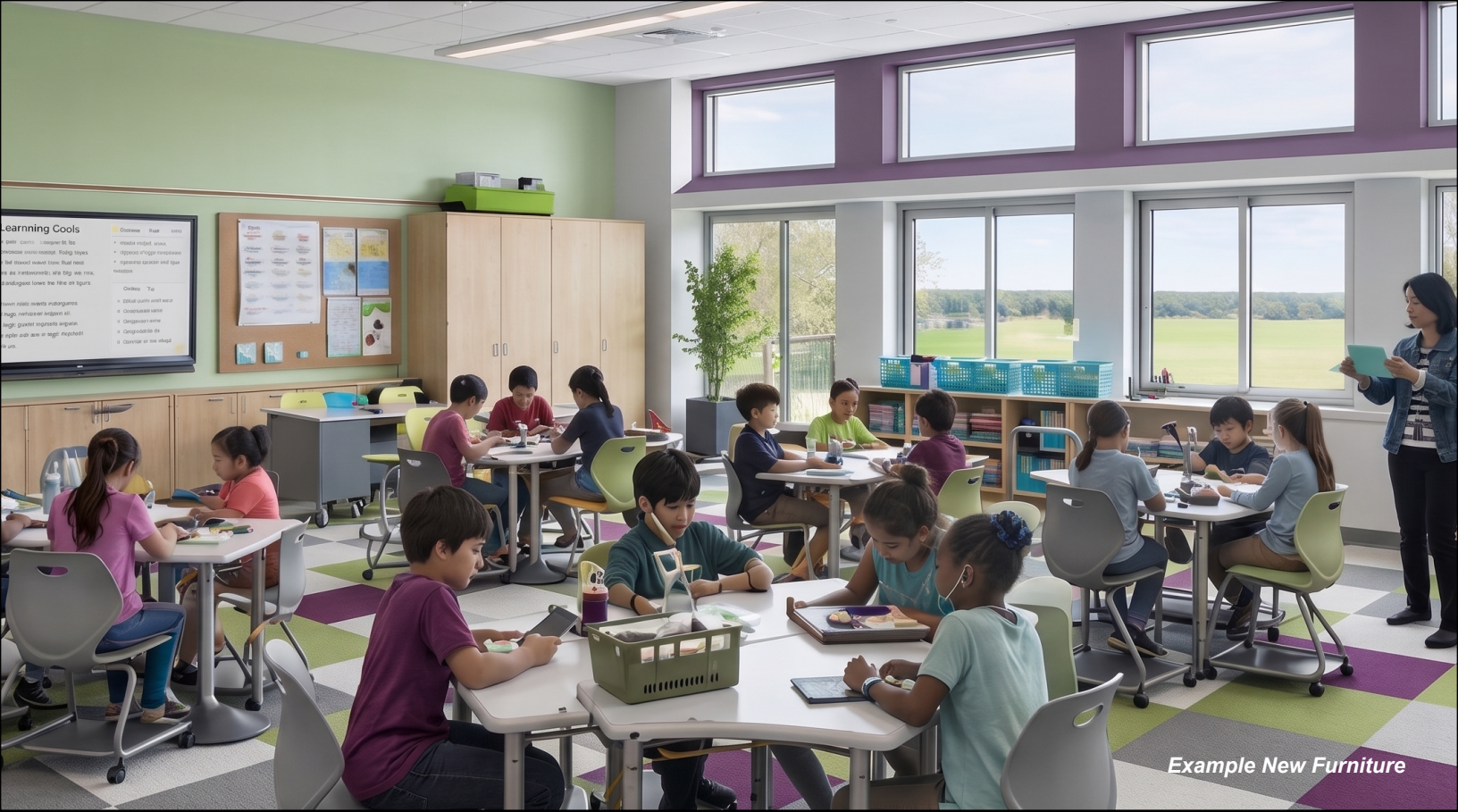
Example New Furniture