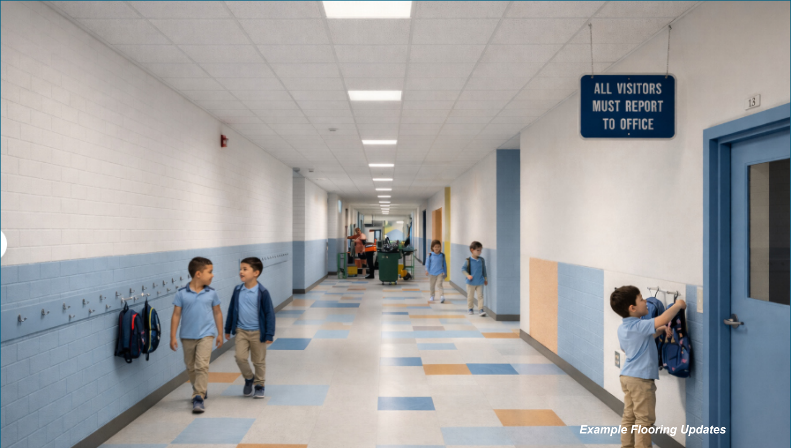
Example Flooring Updates