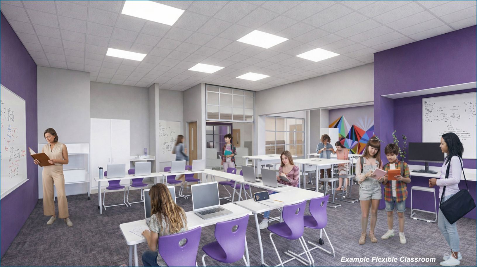
Example Flexible Classroom