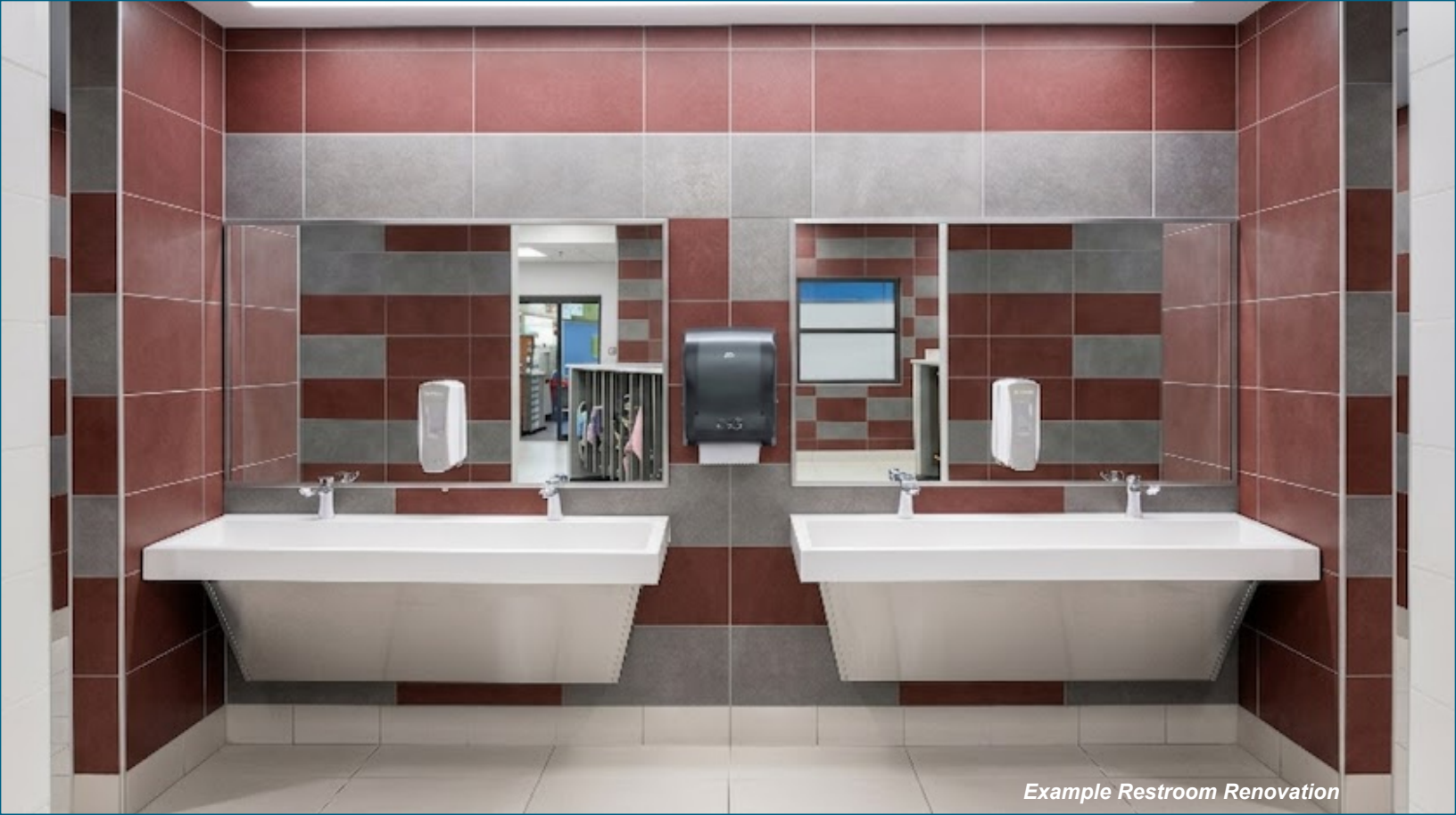
Example Restroom Renovation