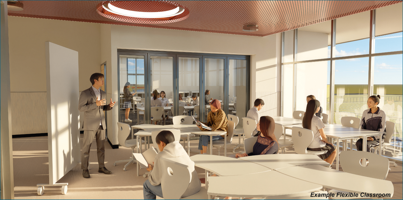
Example Flexible Classroom