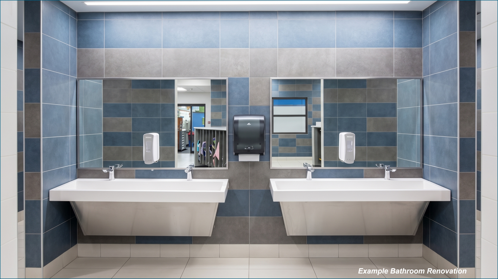
Example Bathroom Renovation