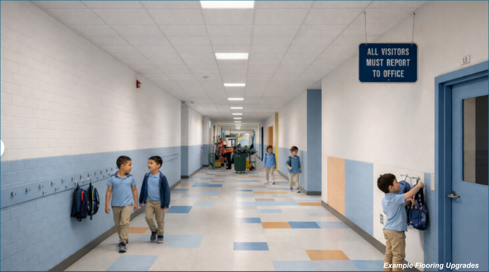
Example Flooring Upgrades