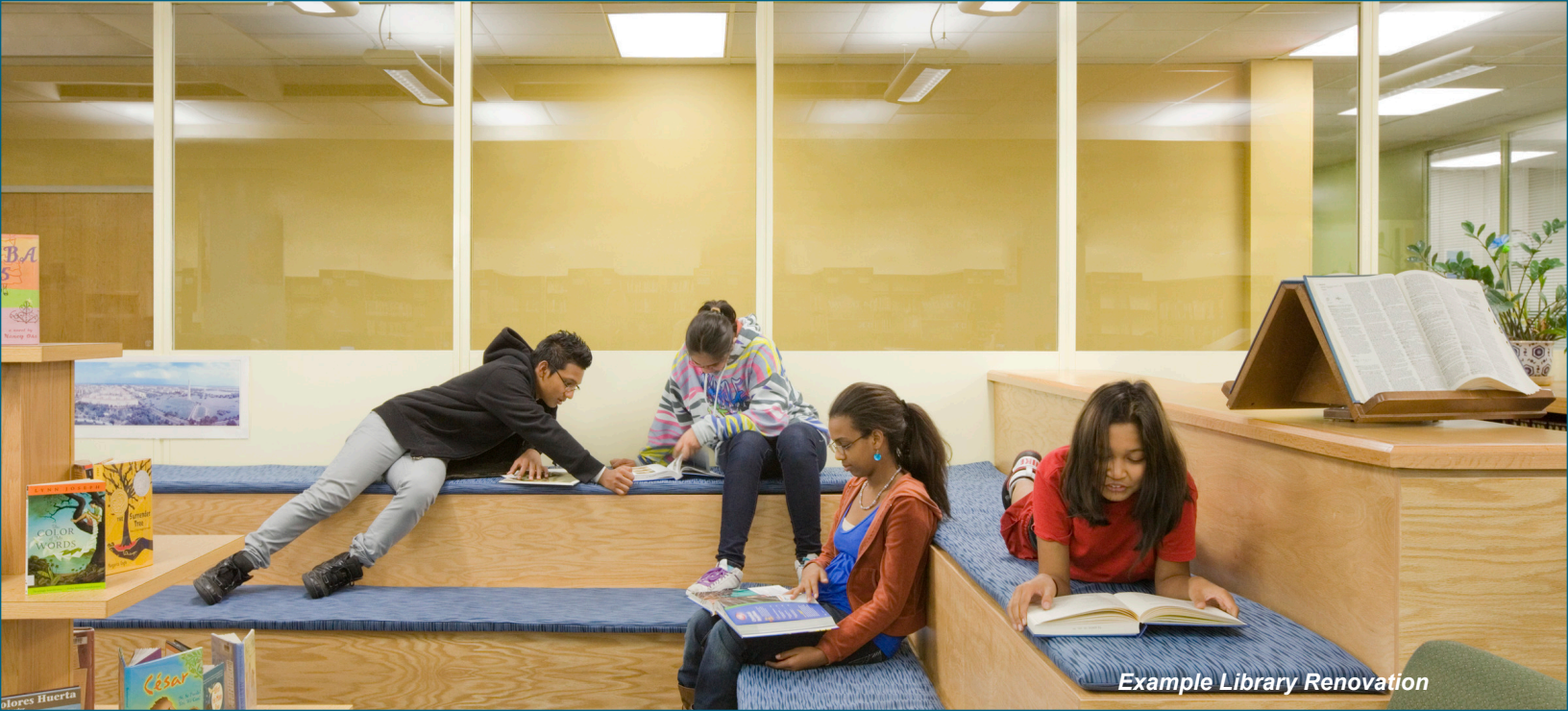
Example Library Renovation