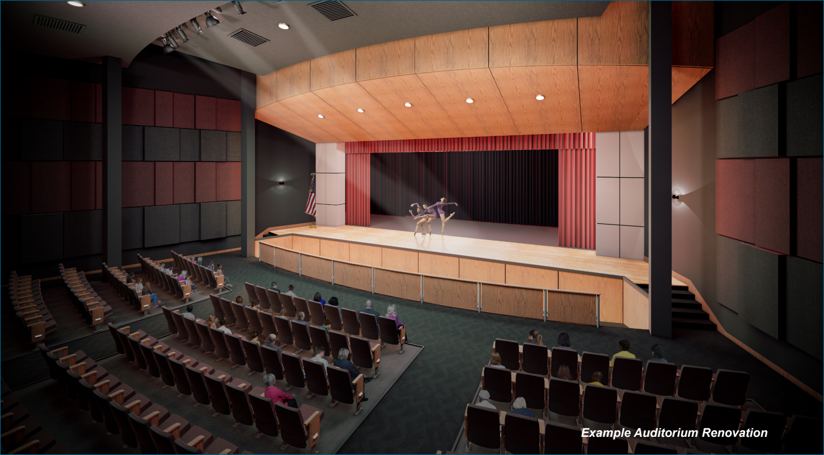
Example Auditorium Renovation