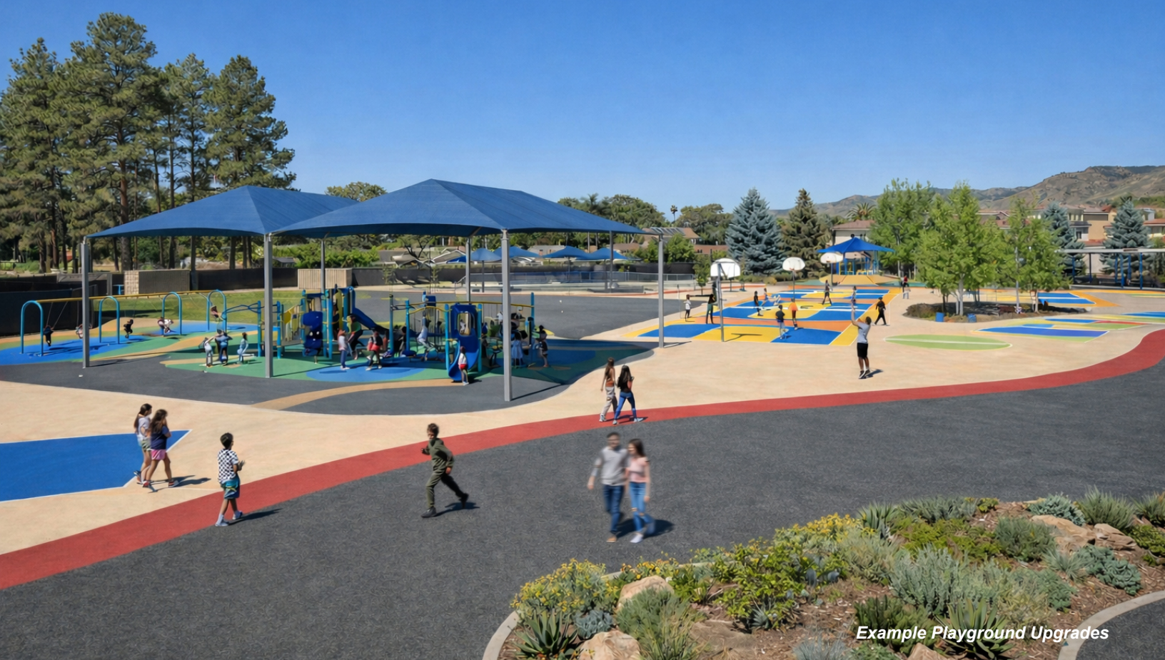
Example Playground Upgrades