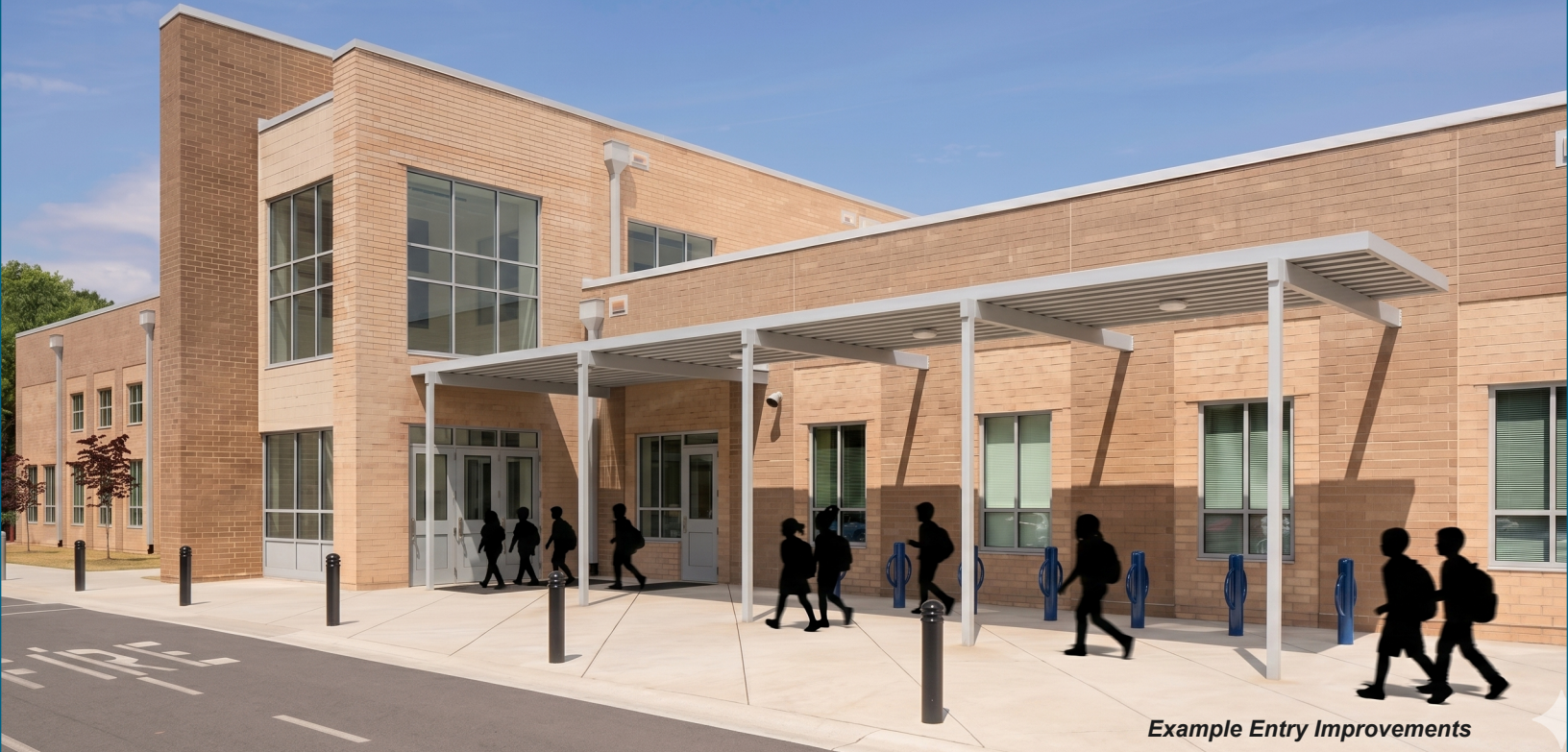
Example Entry Improvements