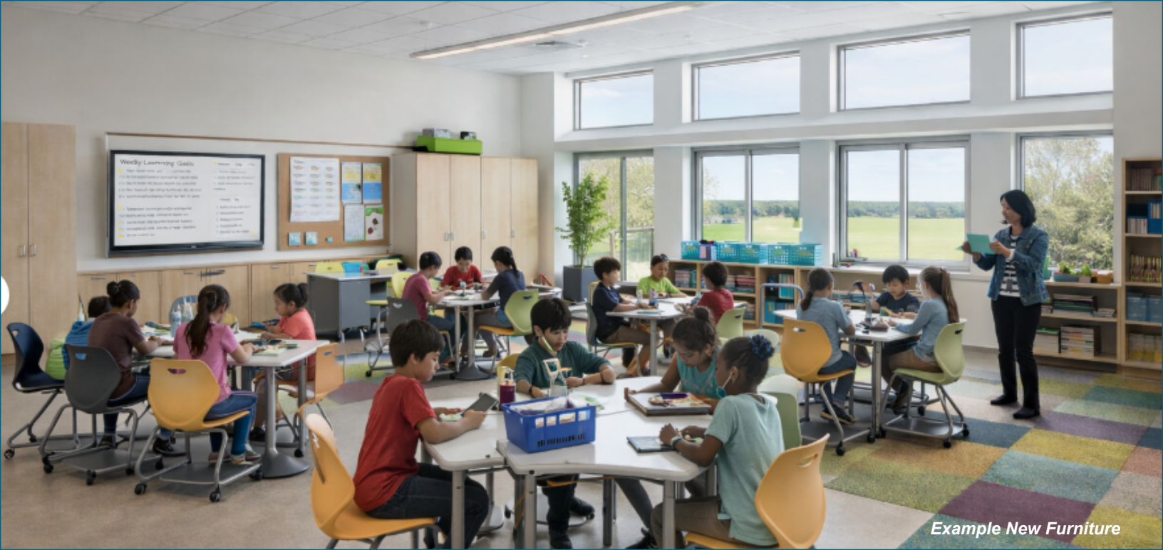
Example New Furniture