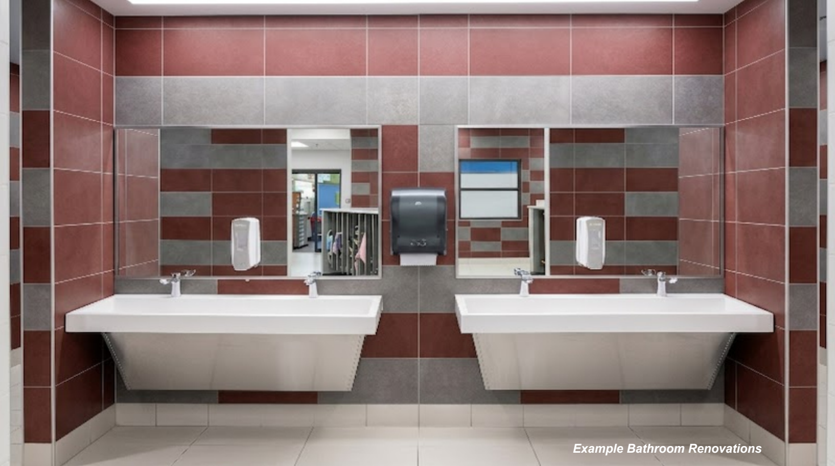
Example Bathroom Renovations