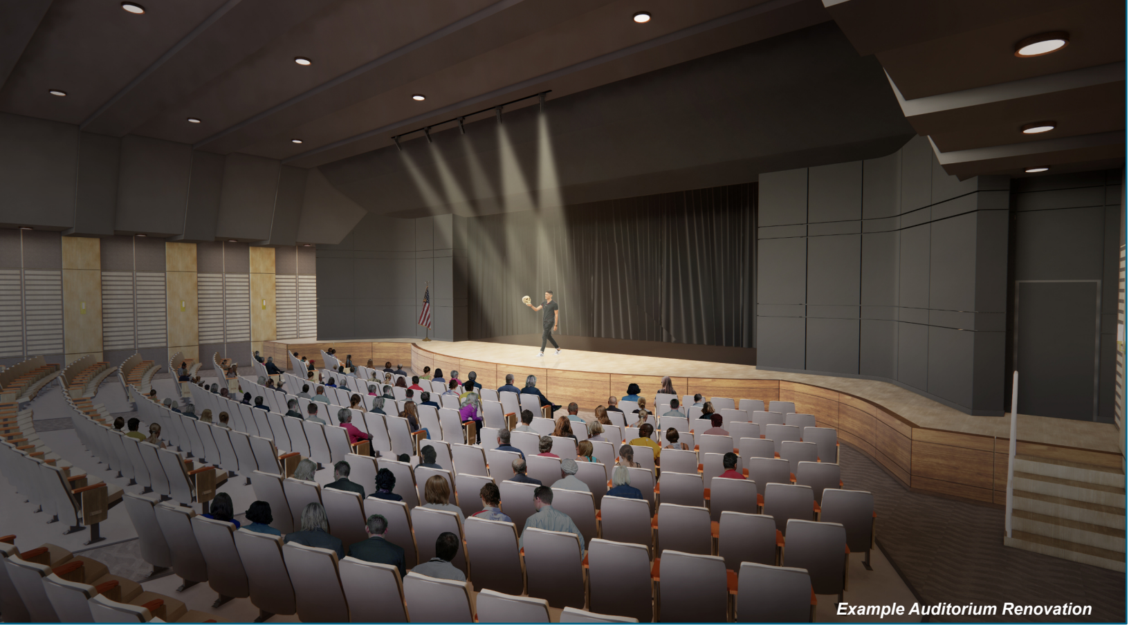
Example Auditorium Renovation