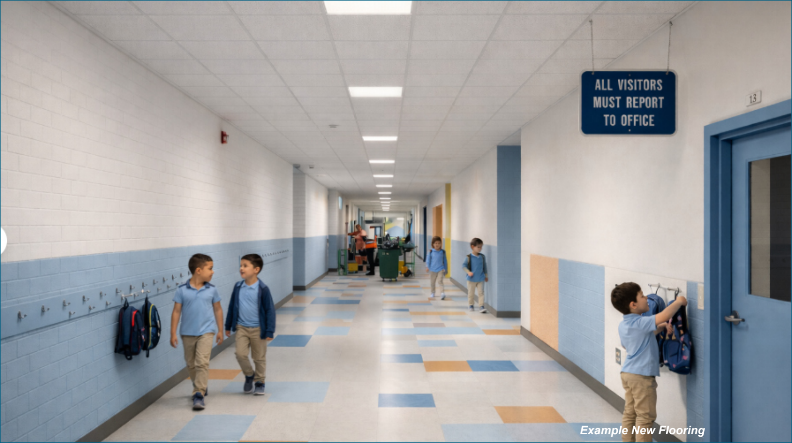
Example New Flooring