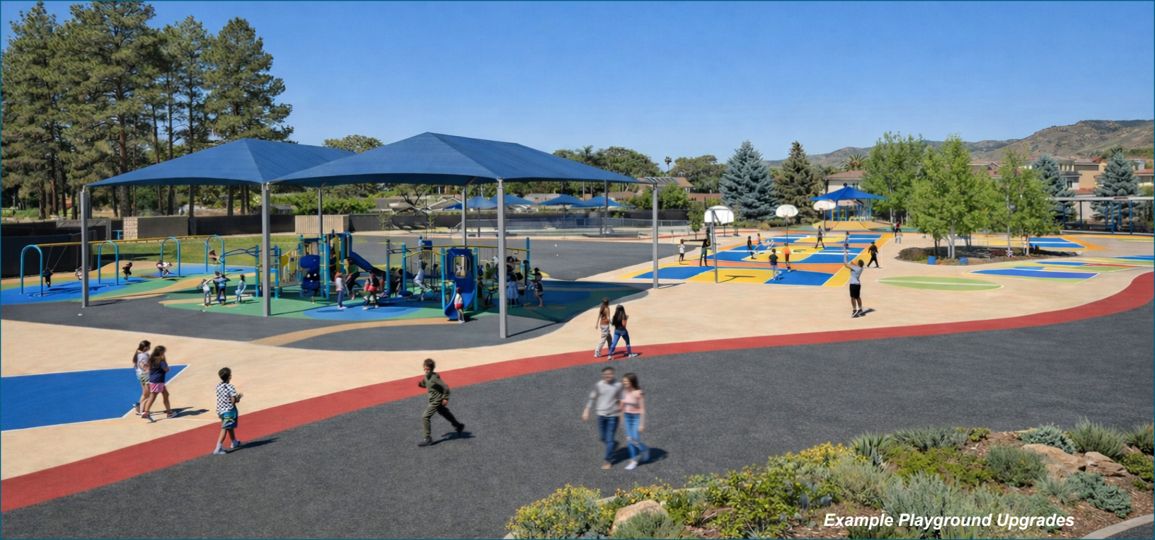
Example Playground Upgrades