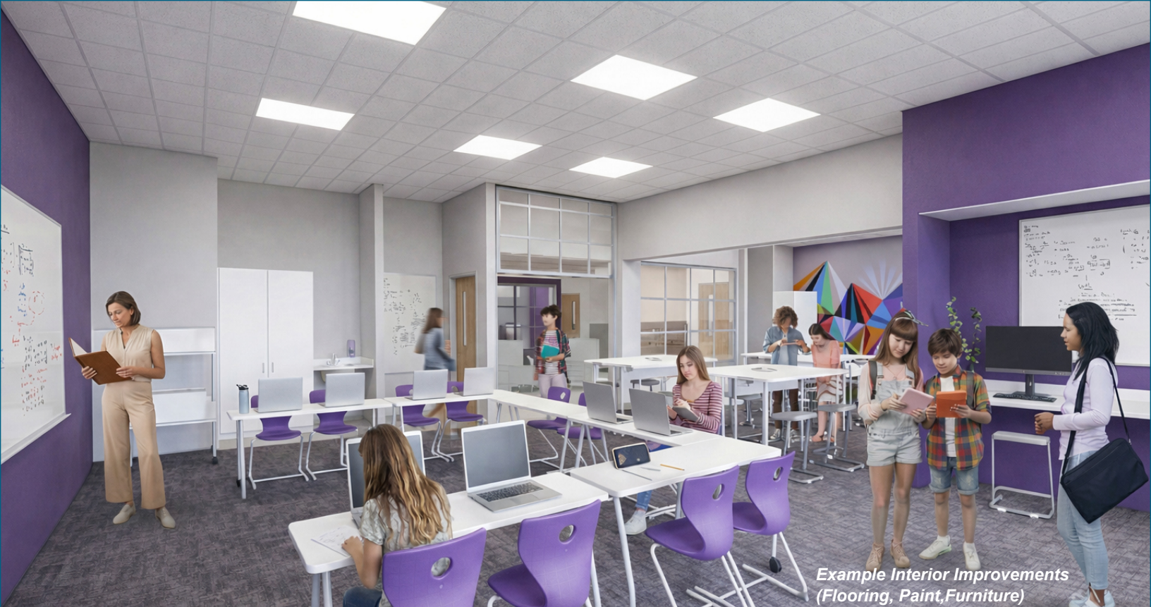
Example Interior Improvements (Flooring, Paint, Furniture)