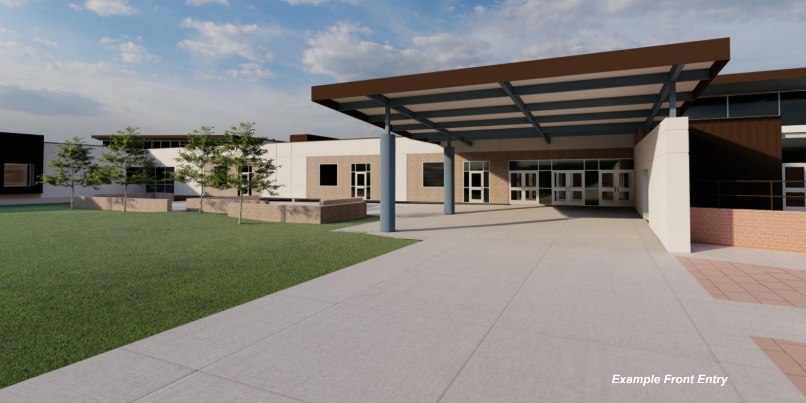
Example Front Entry