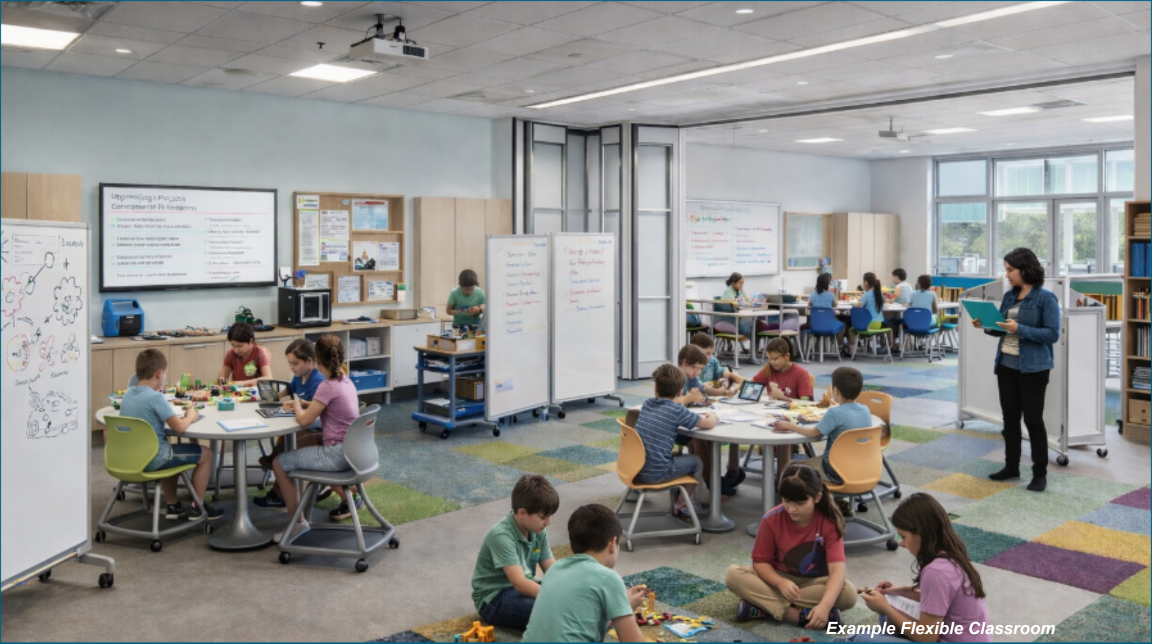
Example Flexible Classroom