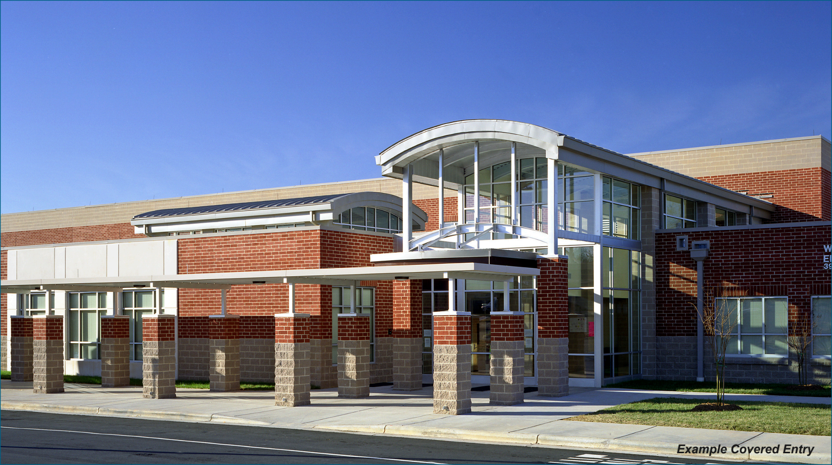
Example Covered Entry