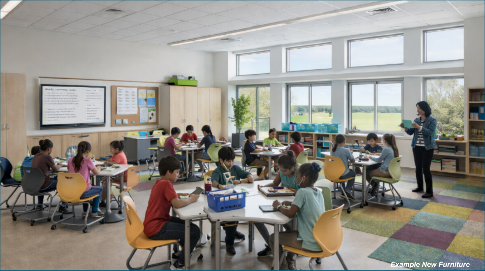
Example New Furniture