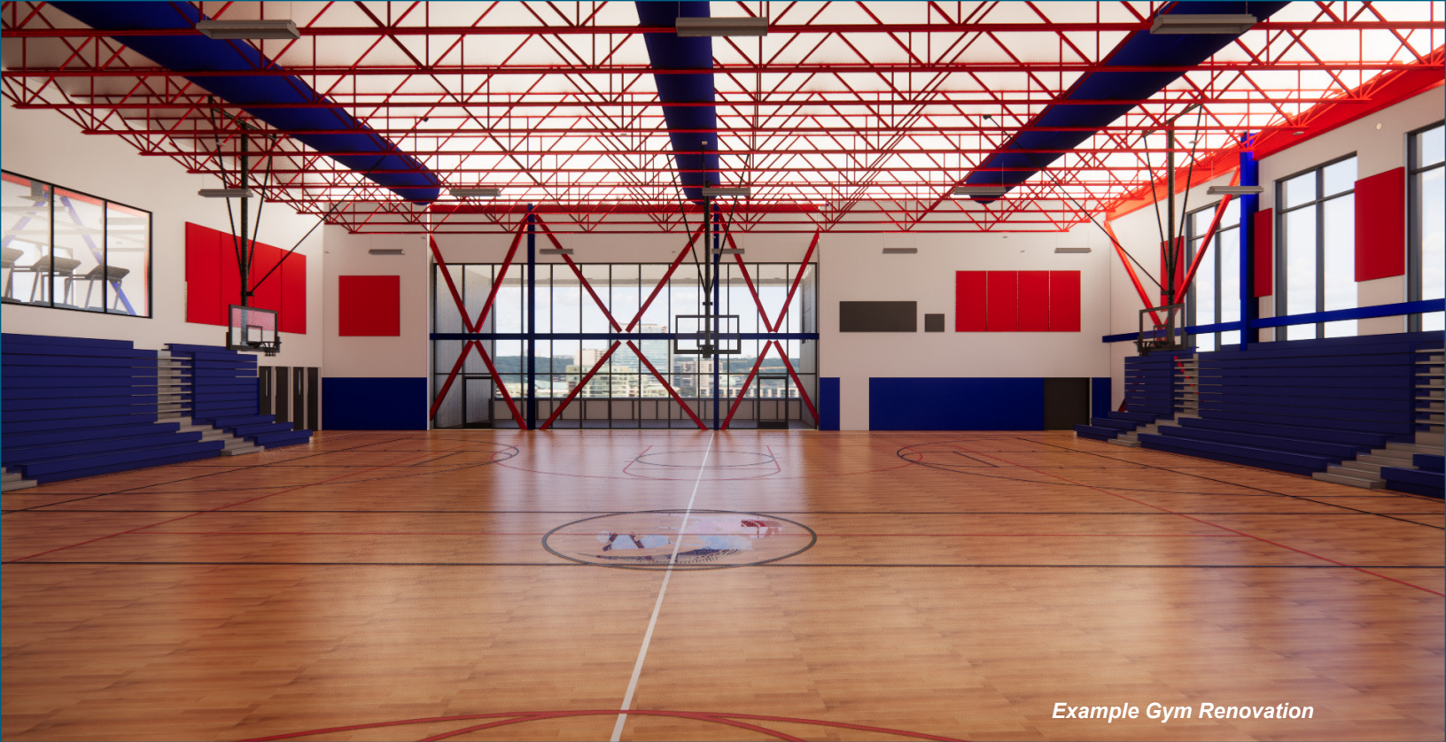
Example Gym Renovation