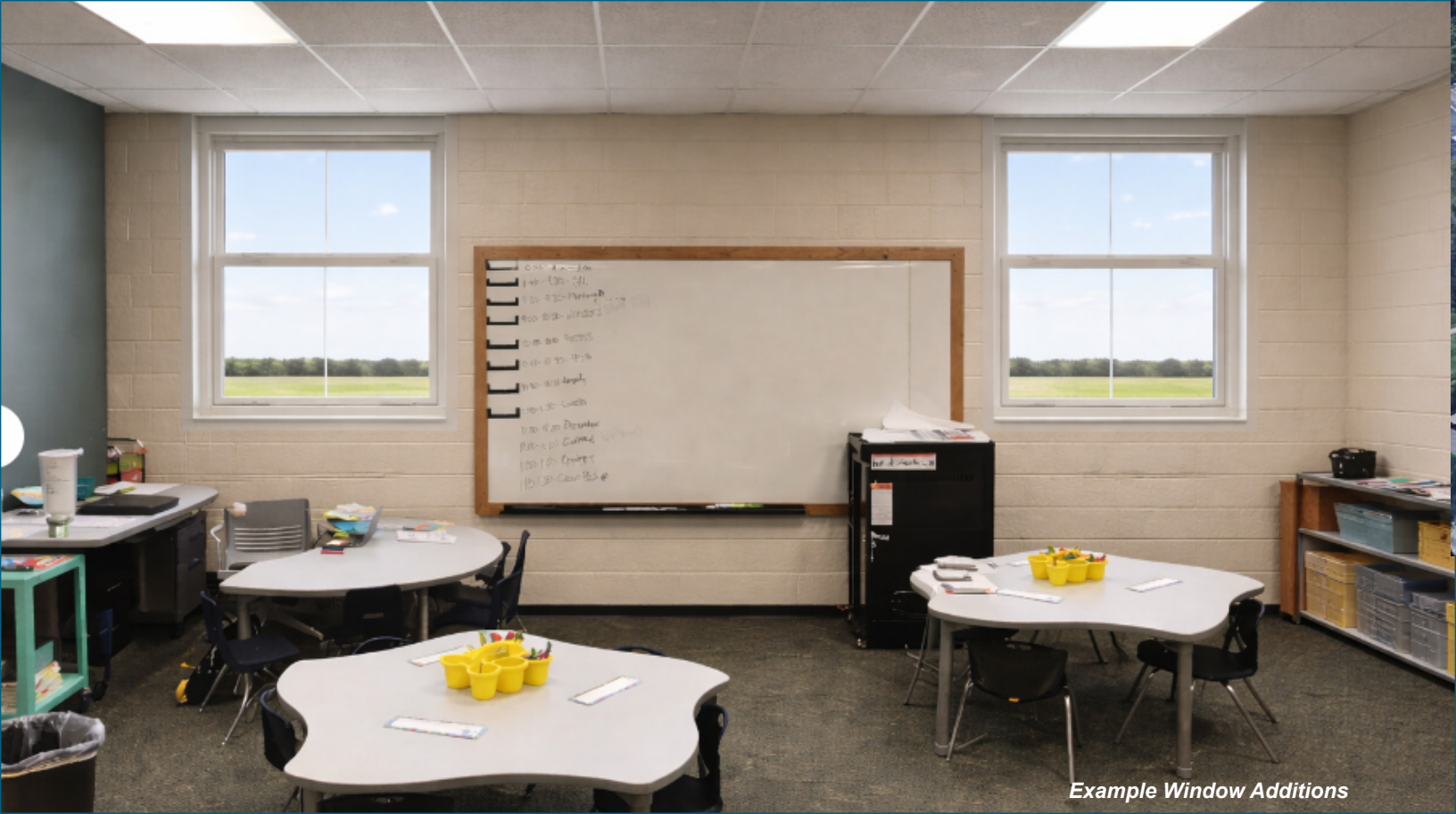
Example Window Additions