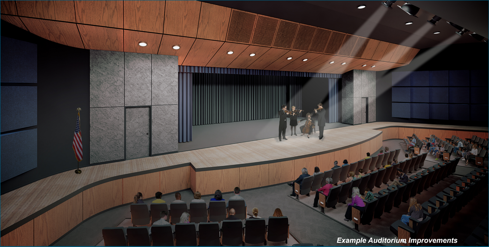
Example Auditorium Improvements