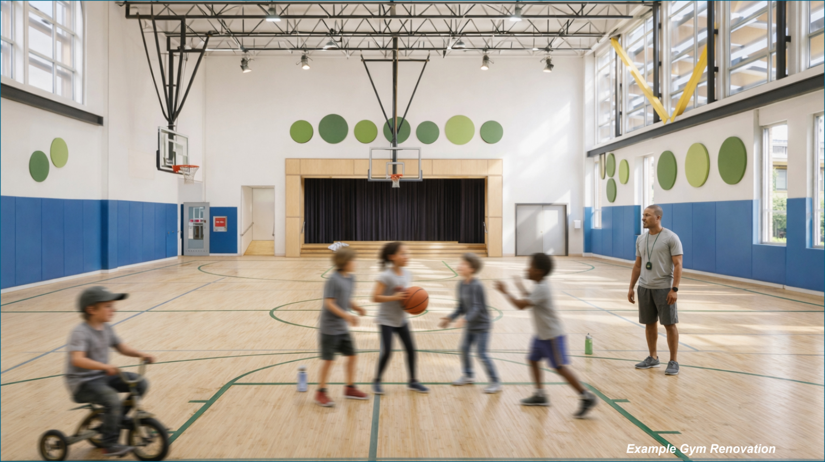
Example Gym Renovation