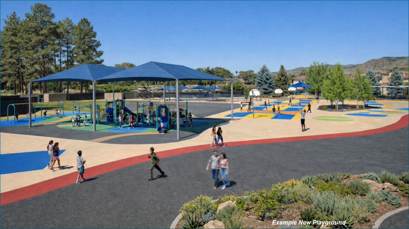
Example New Playground